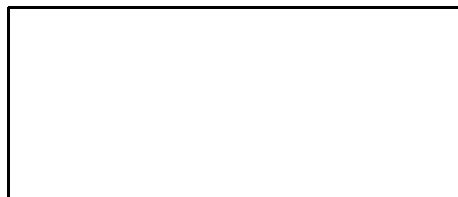
representative's legible signature